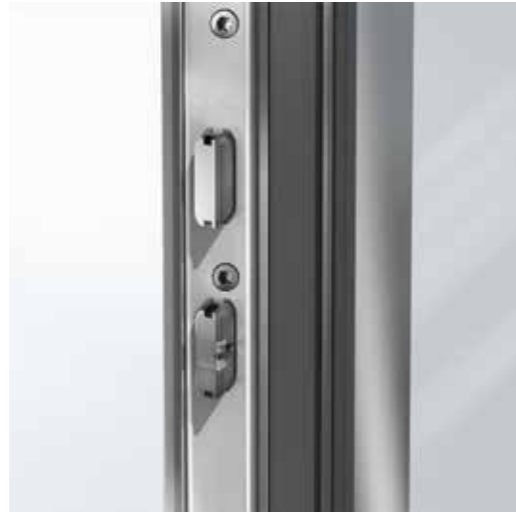
Schueco SafeMatic lock offers convenience and security