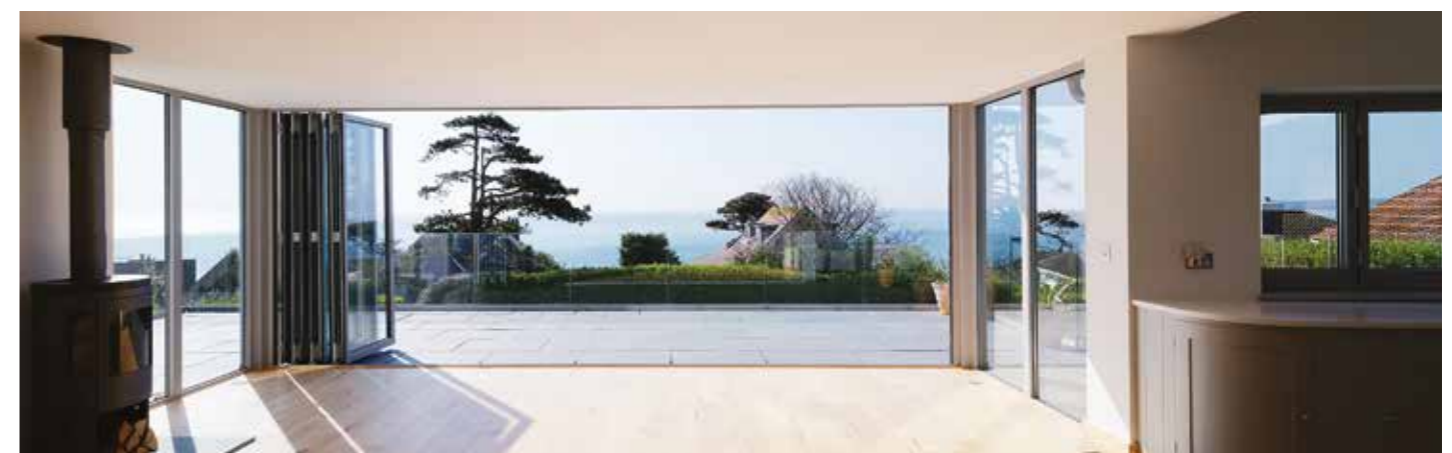
Have complete access to your terrace

In addition, being highly engineered and equipped with a multi-point locking mechanism, a Schueco folding door is exceptionally strong and dependably secure, despite its elegantly slim frames and narrow face-widths.