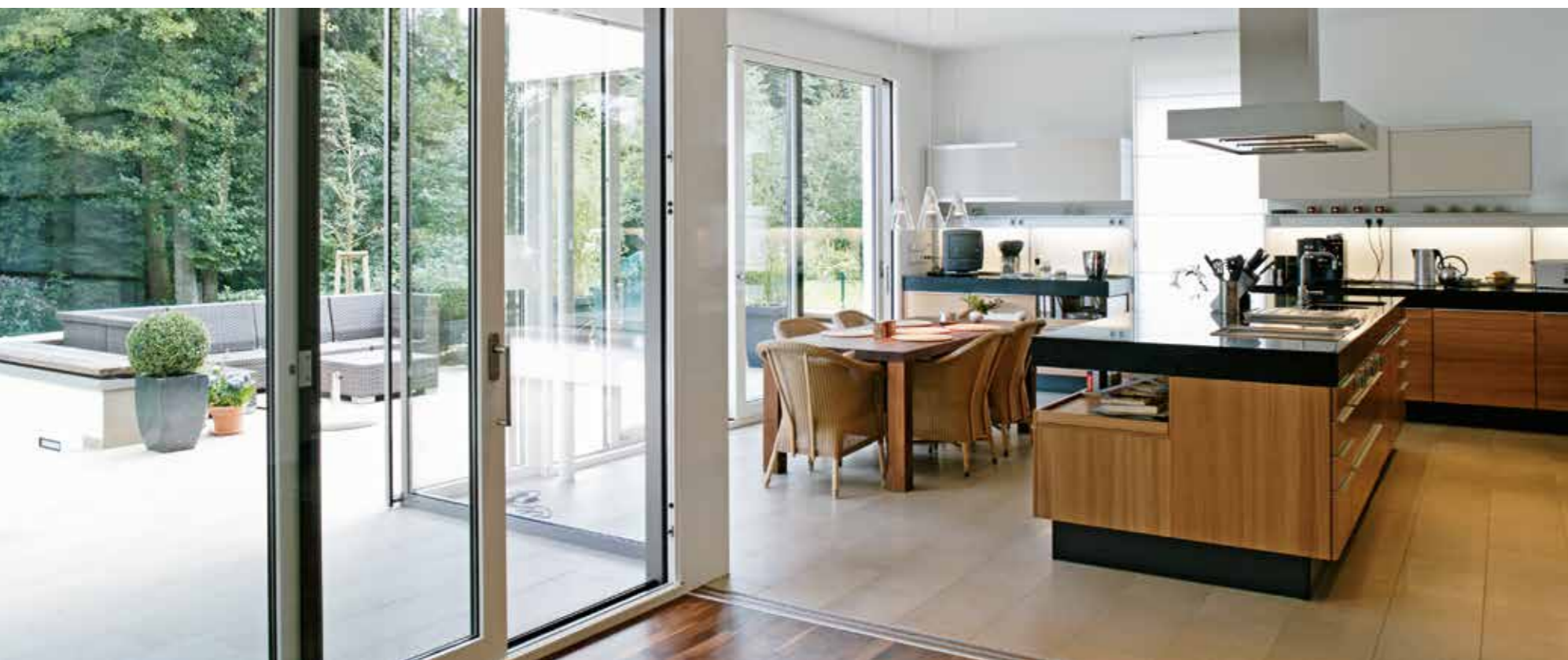
Let a Schueco sliding door bring light into your life