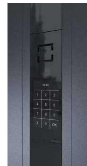
Keyless security access