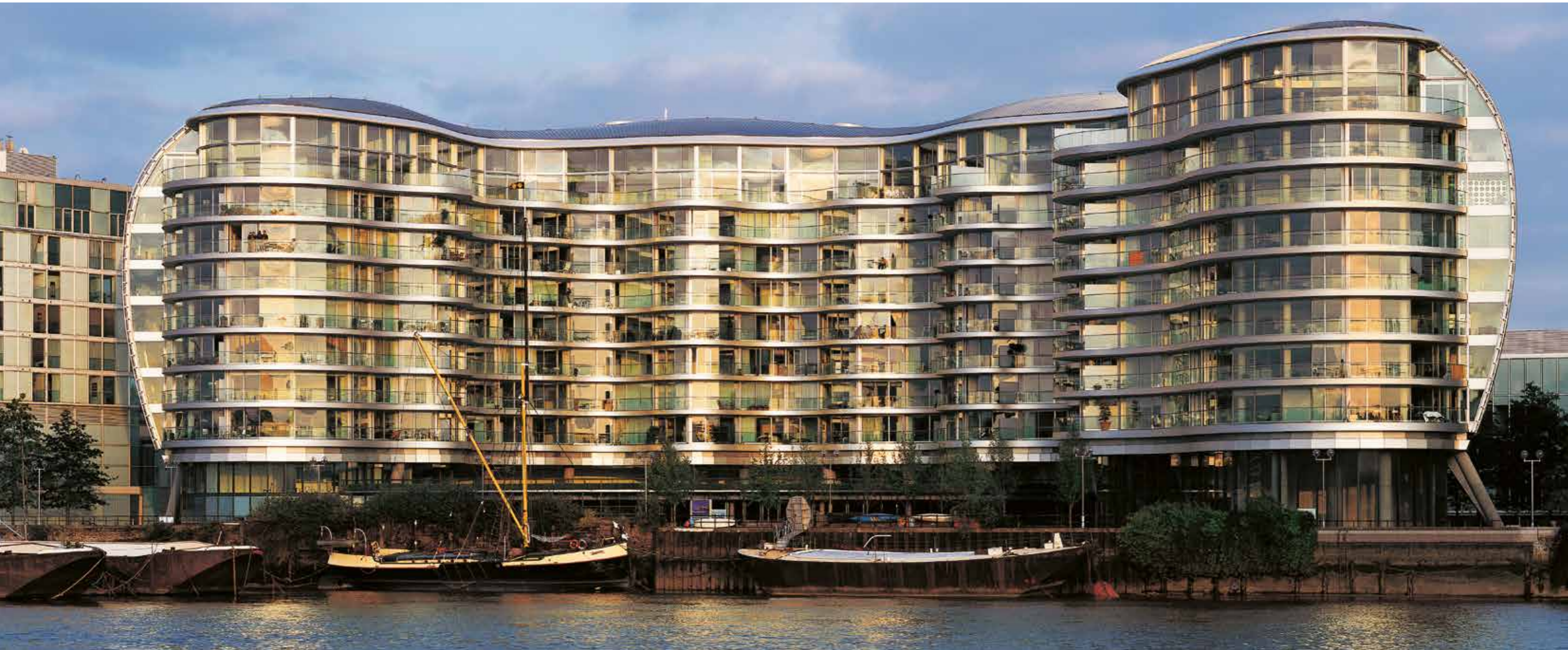
Albion Riverside, London, designed by international architect Foster + Partners and featuring Schueco systems

The systems we produce for the residential market are only one part of our business. Founded in Bielefeld, Germany, in 1951, we are a global company responsible for the aluminium façades, windows and doors on many of the world's most prestigious buildings.