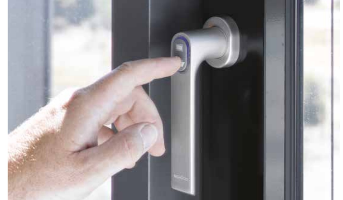
Automation at the touch of a button