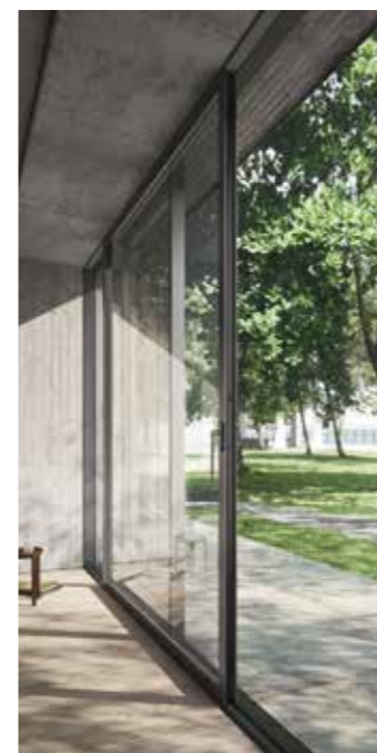
A Schueco lift-slide door has a low threshold

The moment you open a Schueco sliding door – whether it’s a straight slide or lift-slide – the solid feel of the frame and the easy-glide action make it clear you’re dealing with quality.