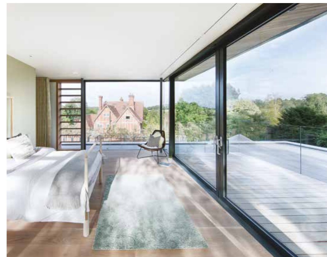
A Schueco highly-insulated sliding door means maximum comfort