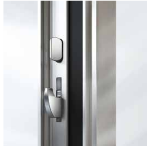
Multi-point locking: the ultimate security option