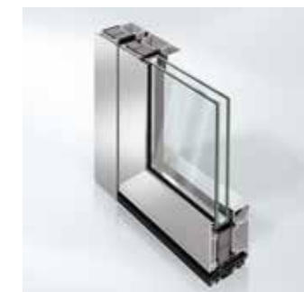
Schueco ADS 75.SI entrance door