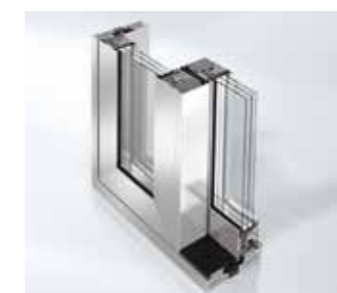
Schueco ASS 70.HI sliding door

And this not only means greater comfort and lower fuel bills, it also allows your home to do its bit for the environment by cutting the levels of CO 2 .