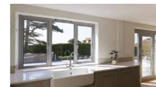
Form meets function, perfectly