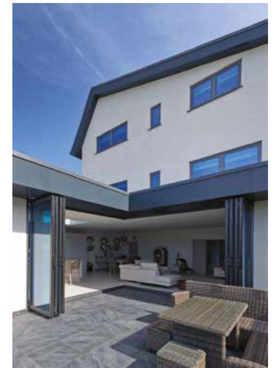
Without a corner post you can open up your entire patio

Everyone loves being in the open air when the sun shines.