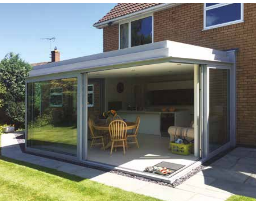
Schueco sliding doors without a corner post open up even more space