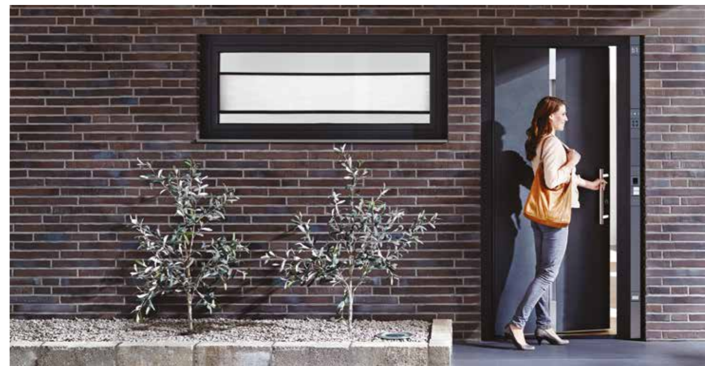
Customise your Schueco entrance door with stylish infill panels

When you visit someone's home, the front door is something you tend to use and forget. Yet its several active roles – as a barrier against the weather, as a guarantor of our security, as an indicator of our taste in design – make it an important feature.