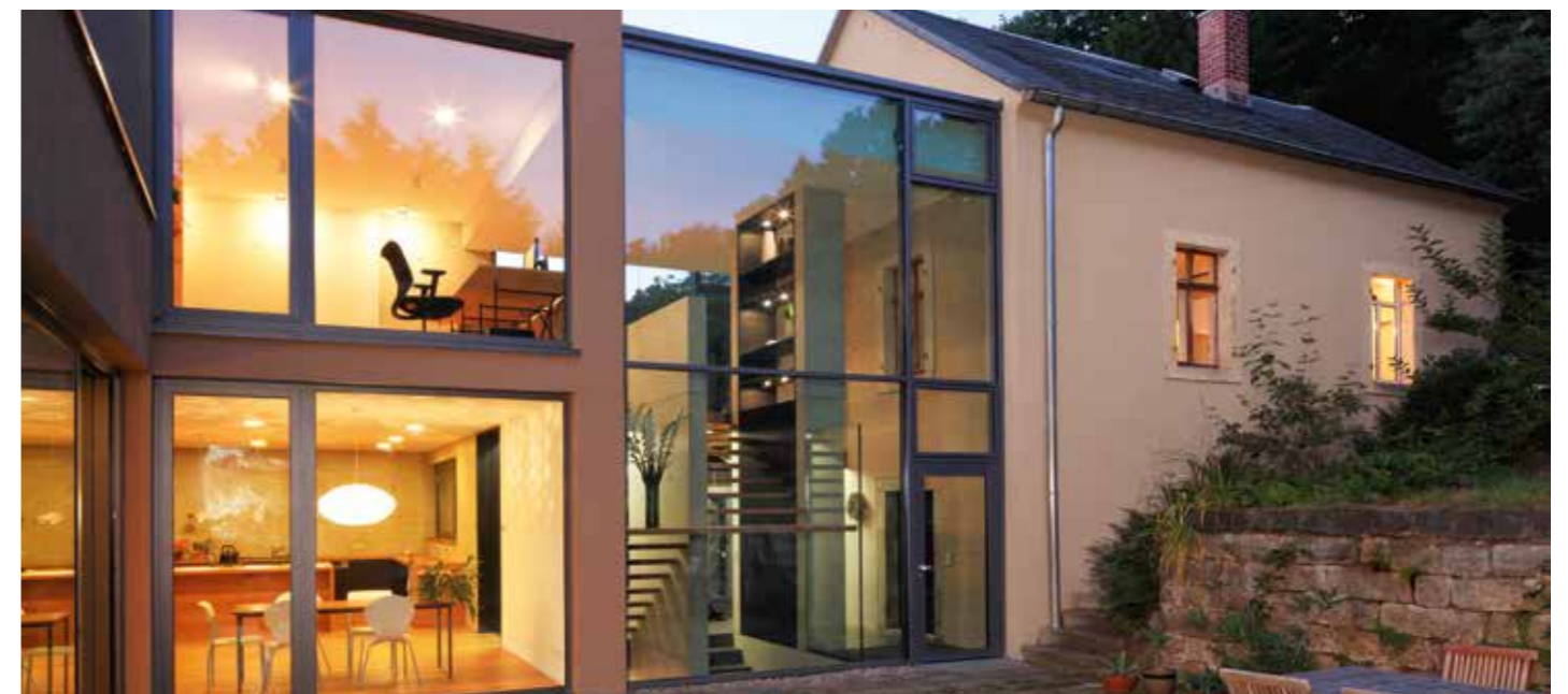
Schueco highly-insulated façades are just one design option