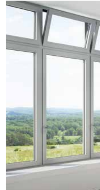
No more stretching to open fanlights