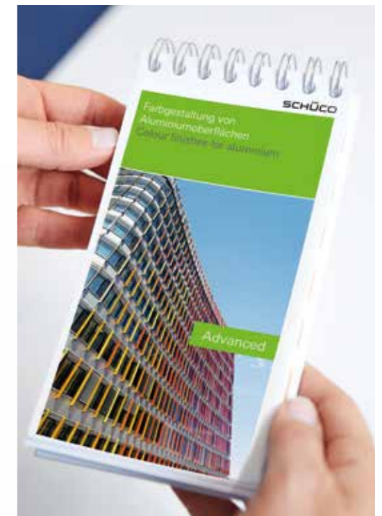
Real choice from the Schueco range of colours and finishes