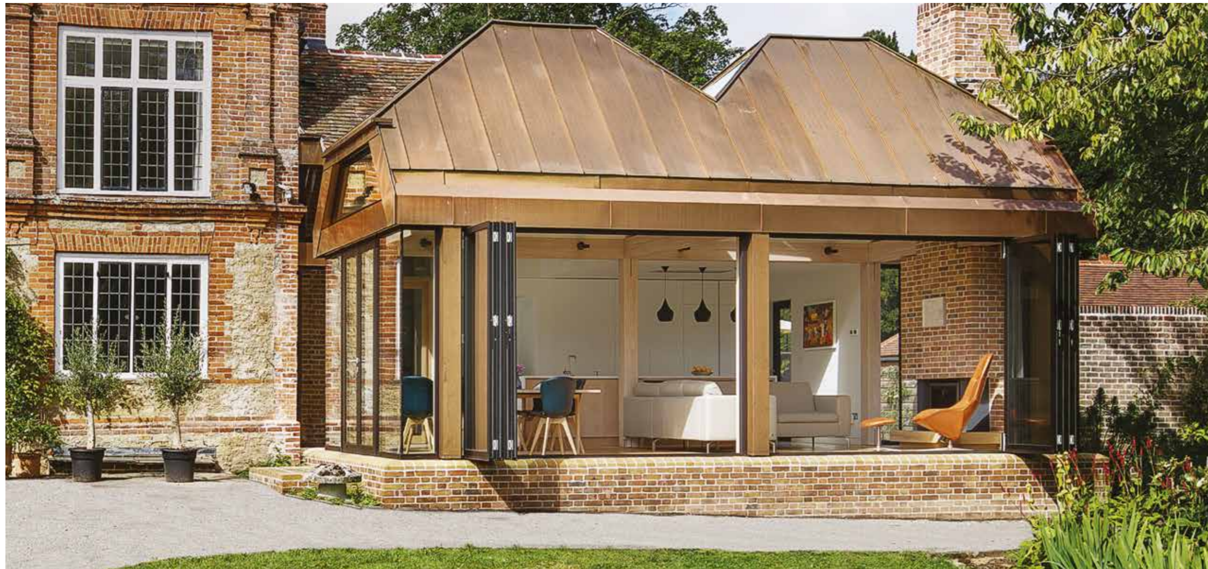
Enjoy a fabulous open air experience