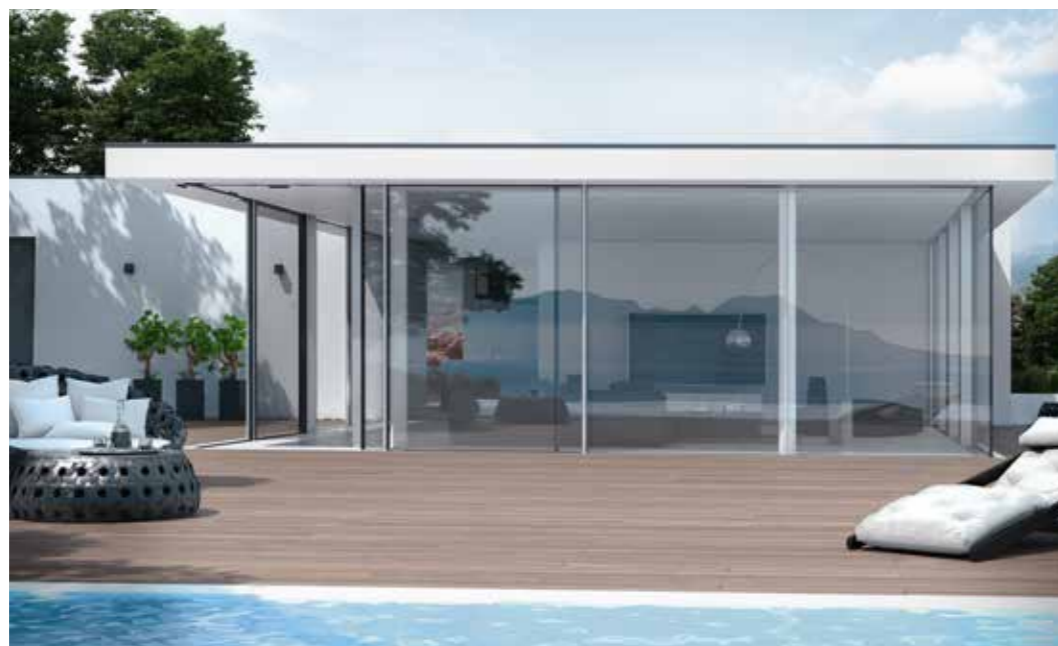
A stylish and contemporary look, courtesy of Schueco

This means you can enjoy the drama of large-scale clear glazing, while still staying warm and comfortable on cold winter days.