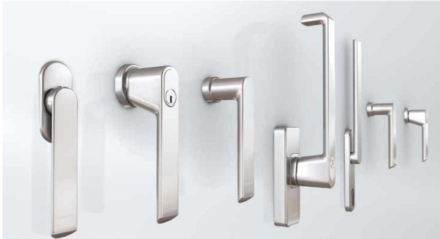
Minimalist design and a range of finishes give Schueco handles for windows and sliding doors their timeless appeal