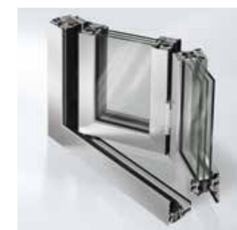
Schueco ASS 80 FD.HI folding door with triple-glazing