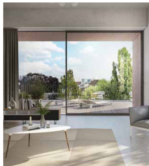
Slide a Schueco door open to enjoy more than the view